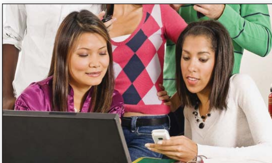
DIGITAL SMARTS: Protecting Your Online Reputation and Safety See page 9.