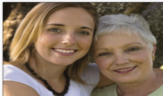
HEALTH AND YOUR GENES See page 3.